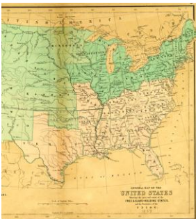
General Map of the United States by Henry D. Rogers (1857)