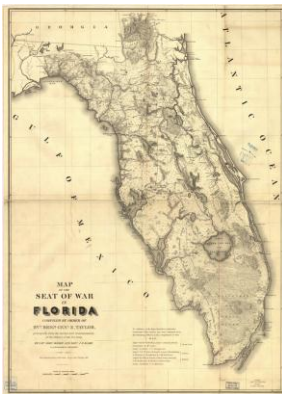
Map of the Seat of War in Florida, created by order of General Zachary Taylor (1839)