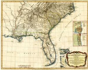
Romans' General Map of the Southern British Colonies (ca. 1776)